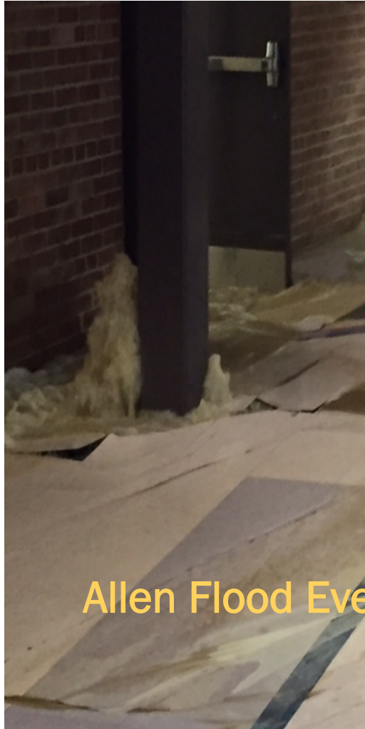
Allen Flood Event, August, 2016