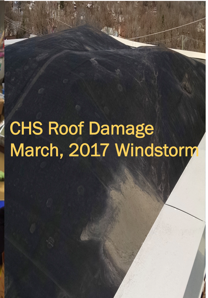
CHS Roof Damage March, 2017 Windstorm